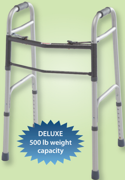
DELUXE 500 lb weight capacity