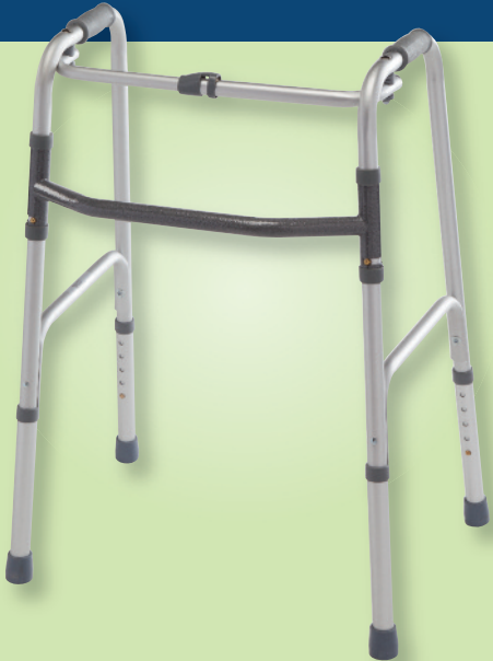
WLK1001 Height: 32"-36"