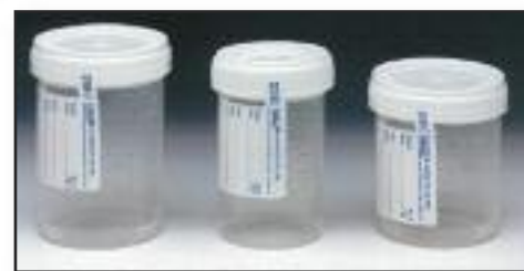
4936, 4938, M4937