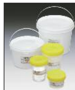
P02-H2502-C, P02-H5002-C, P02-H10002-C, P02-H20002, P02-H50002