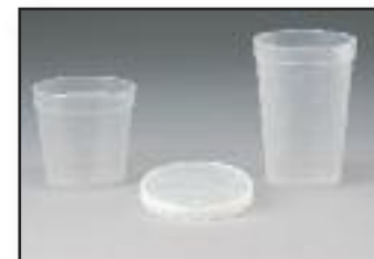
PC1756-1K0, PC1757-1K0, PC1758-1K0